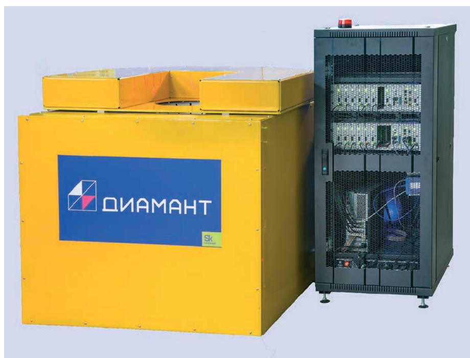
Neutron module and electronics crate